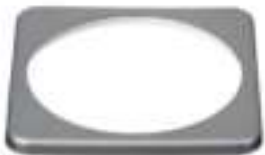
BMV bezel square