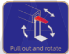
Pull out and rotate

Depending on the position of the buckle joint The maximum load : \leq 5 kg