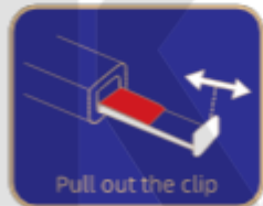
Pull out the clip