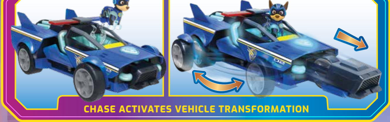
CHASE ACTIVATES VEHICLE TRANSFORMATION