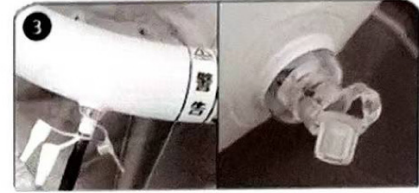
3. Inflate the air ring. When inflating, use a large inflatable head to inflate. When deflating, insert the tail of the air cap into the air nozzle, Holding up black flakes, hearing airflow is OK.