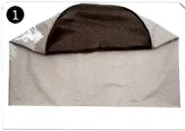
1. Unfold the bathtub