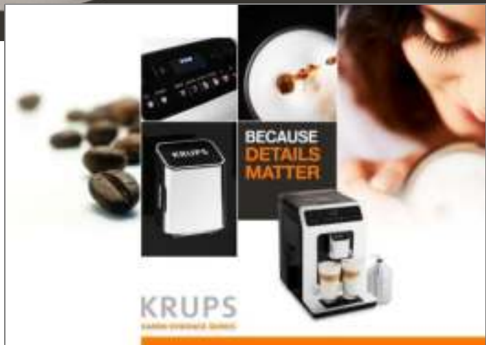
EVIDENCE EA89 - FULLY AUTO ESPRESSO MACHINE FULLY AUTO EVIDENCE MET CHROME WITH XS6000 EA891C10