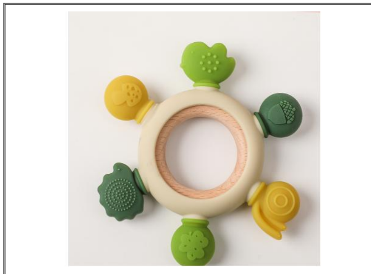
CRT authenticate the photo(s) on original report only