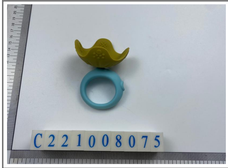
The photo(s) below were provided by client