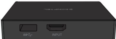
Konftel AV Grabber