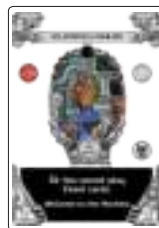
Persistent modifier cards have portraits

Some unusual Modifiers — those with persistent effects — have portraits. These cards represent momentous changes in their Character's life. Their effects persist even when their effect text is covered up, which is the only exception to the cardinal rule of Gloom in Space . See "Effect Categories" for more detailed information about persistent effects.