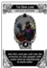
Character cards have full-color portraits.

Spread the twenty Character cards out on the table where everyone can see them. Each player chooses four. All chosen cards are laid face up on the table in front of their owners, where the other players can also see and reach them. Return any unused Characters to the box. They won't be used.