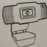
Webcam * 1