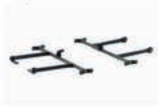
STF-22-4K METAL FRAME Page.60