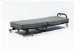
STF-110 FOLDABLE SPRING BED Page.65