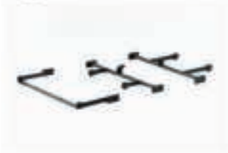
STF-23-4K METAL FRAME Page.59