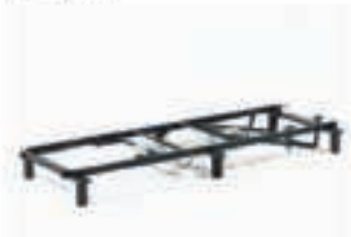
STF-25-5K METAL FRAME Page.57