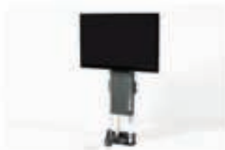
ST-74 TV LIFT Page.74