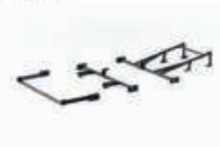
STF-23-5K METAL FRAME Page.59