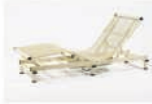
STF-10-4K GOLD WAVE Page.24-29