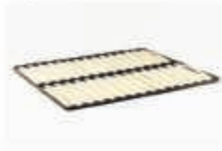
STF-141 SLETTED BED Page.66