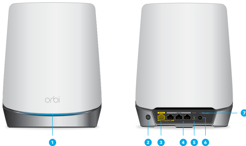
Figure 1. Orbi router front and back views

The following figures shows the Orbi router hardware features.