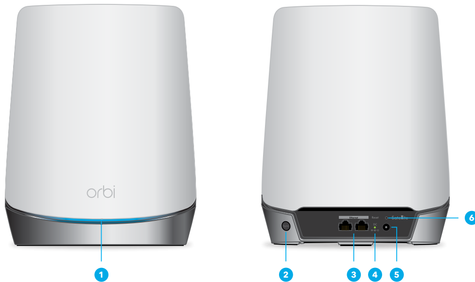
Figure 2. Orbi satellite front and back views

The following figures shows the Orbi satellite hardware features.