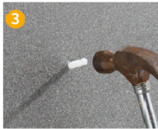
3 Drive in the expansion screw