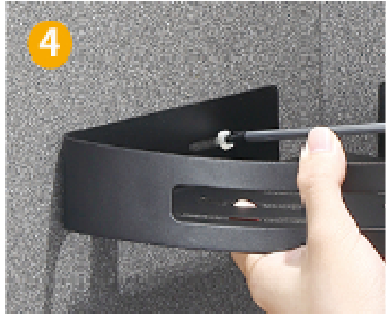
4 Screw on and tighten the screws