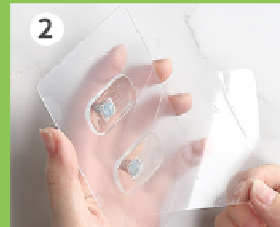
2 Tear off the nail free adhesive backing film