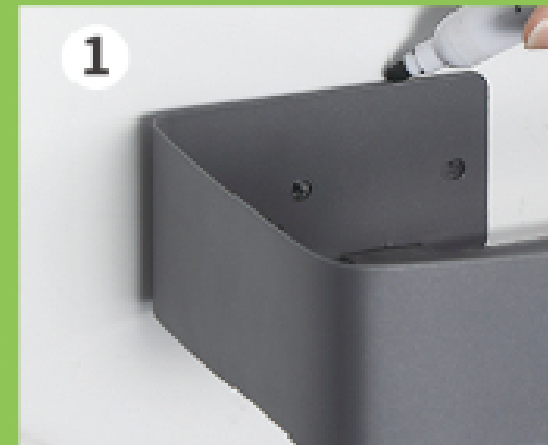
1 Mark the installation location

Please wipe the wall clean and keep it dry before installation