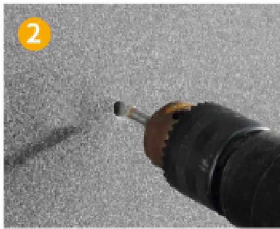
2 Drill with a 6mm drill bit