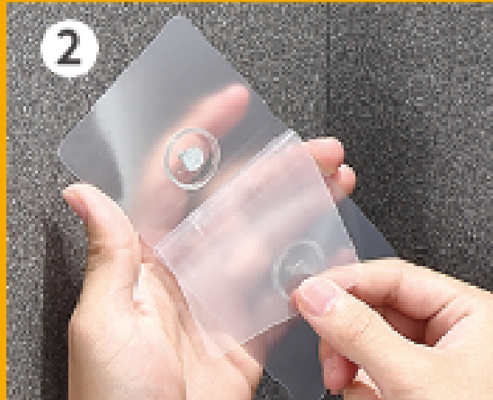
2 Tear off the nail free adhesive backing film