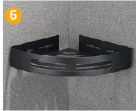
6 The installation is complete