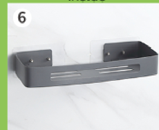
6 The installation is complete

We are serious about doing every product, please give us a good comment if you think the quality is good. Thank you!