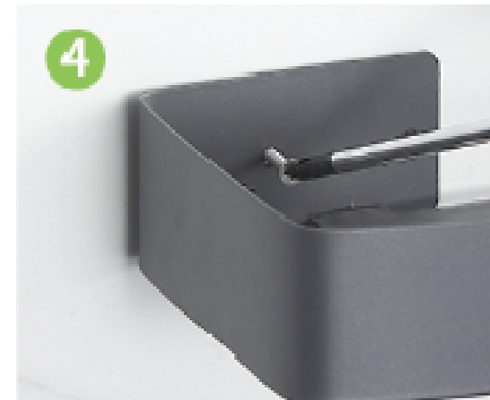
4 Screw on and tighten the screws