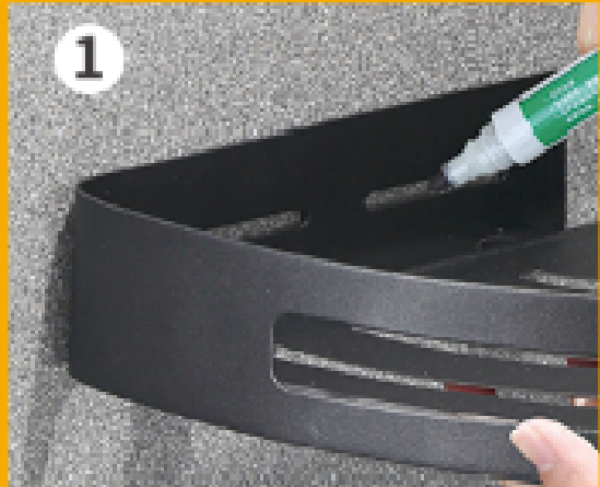
1 Mark the installation location

Please wipe the wall clean and keep it dry before installation