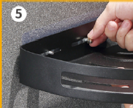
5 Install the rack in 72 hours