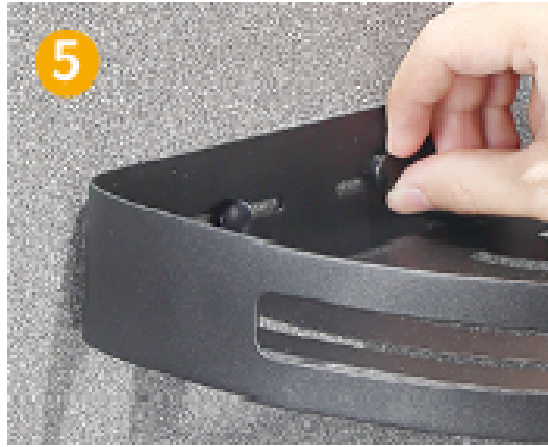
5 Cover with a decorative cap