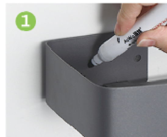
1 Mark the installation location