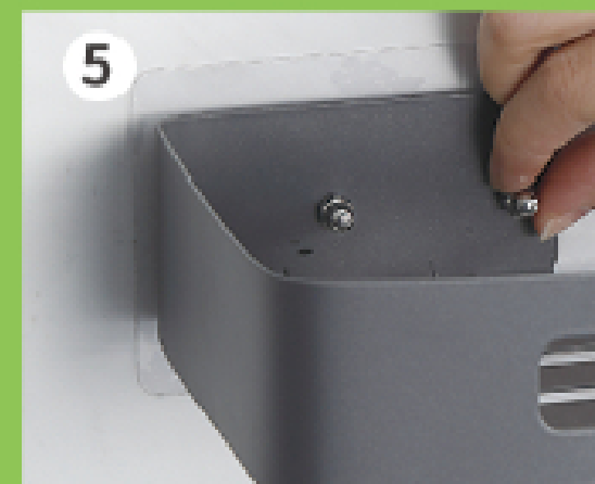
5 Install the rack in 72 hours