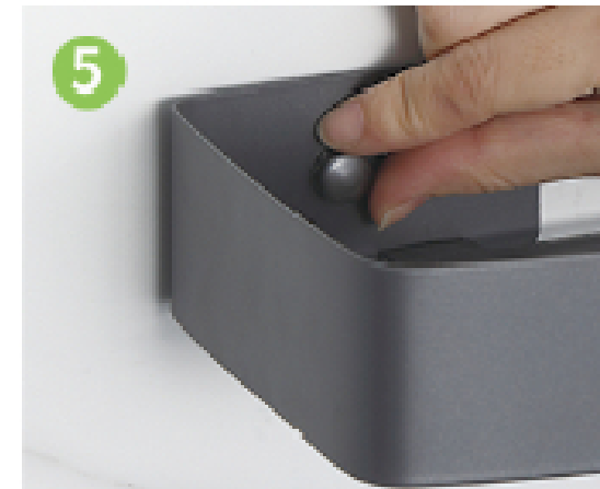
5 Cover with a decorative cap