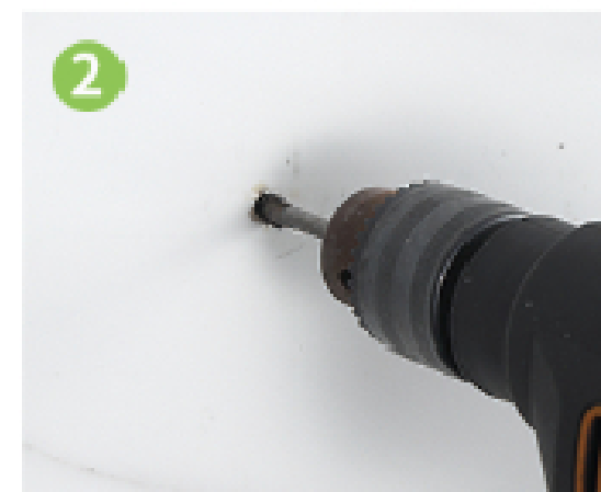
2 Drill with a 6mm drill bit