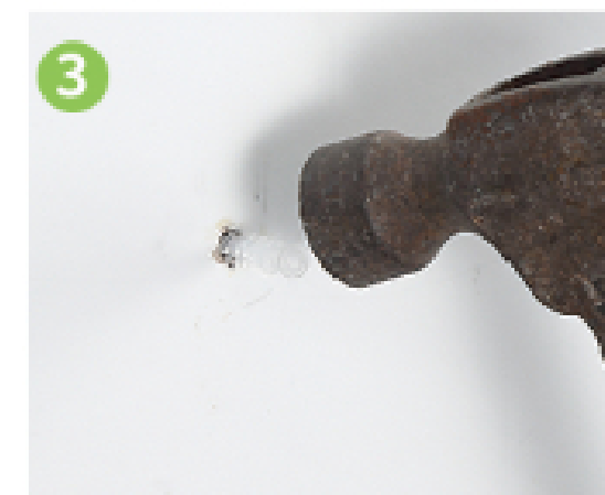
3 Drive in the expansion screw