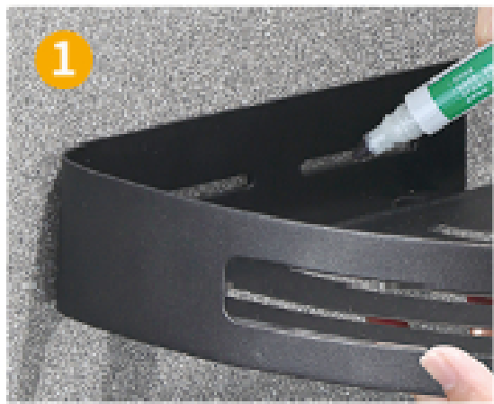
1 Mark the installation location