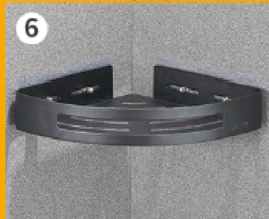
6 The installation is complete

We are serious about doing every product, please give us a good comment if you think the quality is good. Thank you!