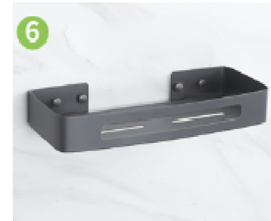
6 The installation is complete