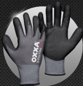
X-PRO-FLEX 51-292 Art. no. 1.51.292.00