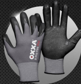
X-PRO-FLEX PLUS 51-295 Art. no. 1.51.295.00