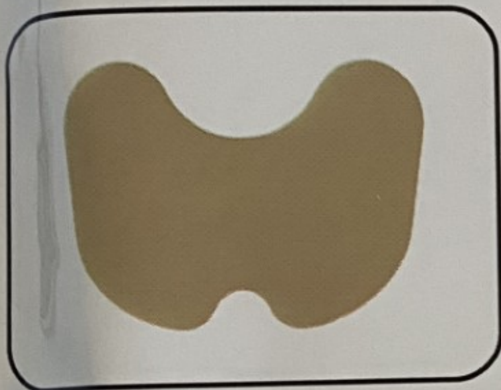
Take out the knee patch

Directions: Open the packaging and remove the backing paper. Clean the affected area making sure it's fully dried before applying the relief patch then apply the relief patch to the affected area. Each application can last for 12-24 hours.