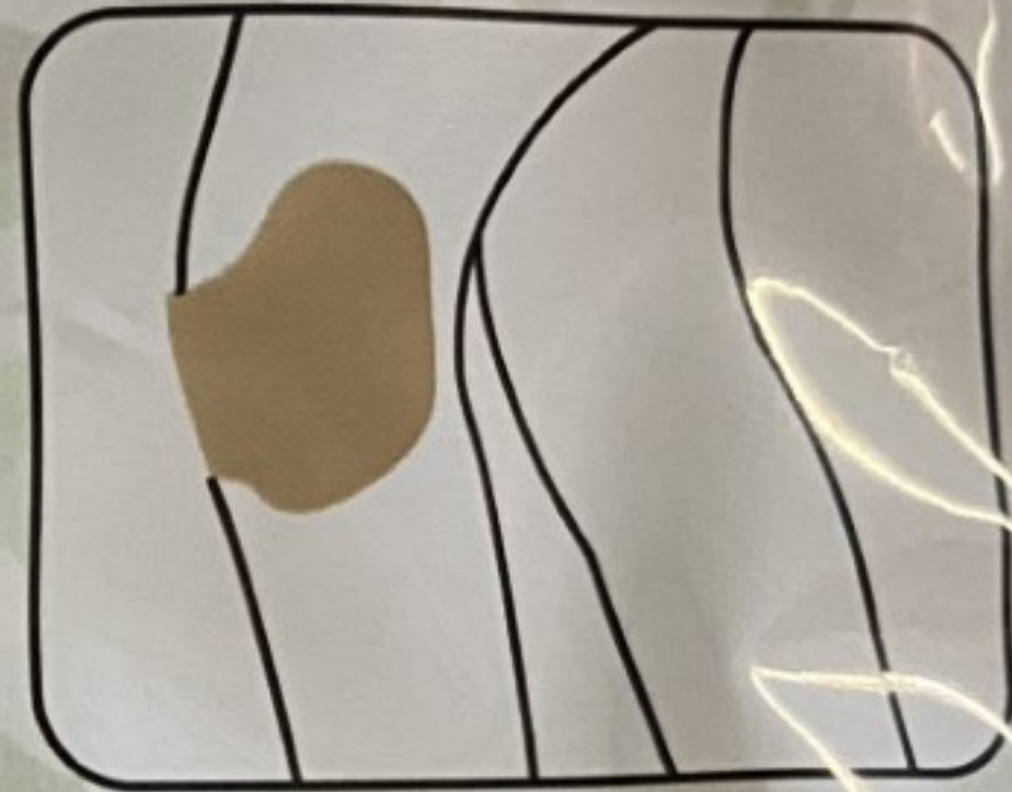
Stick to desired area