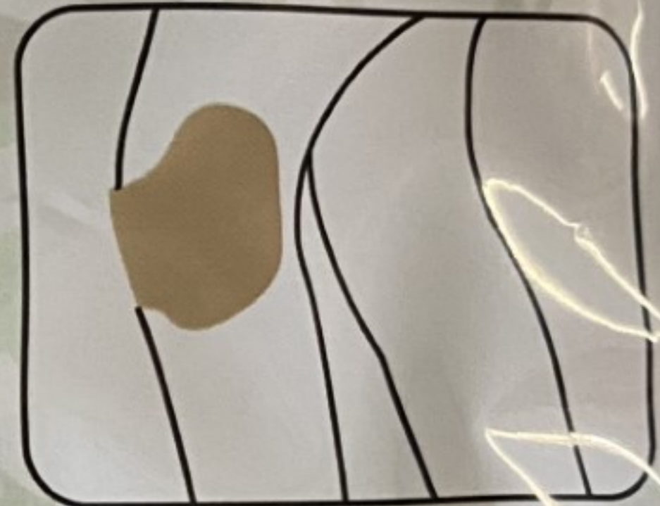
Stick to desired area