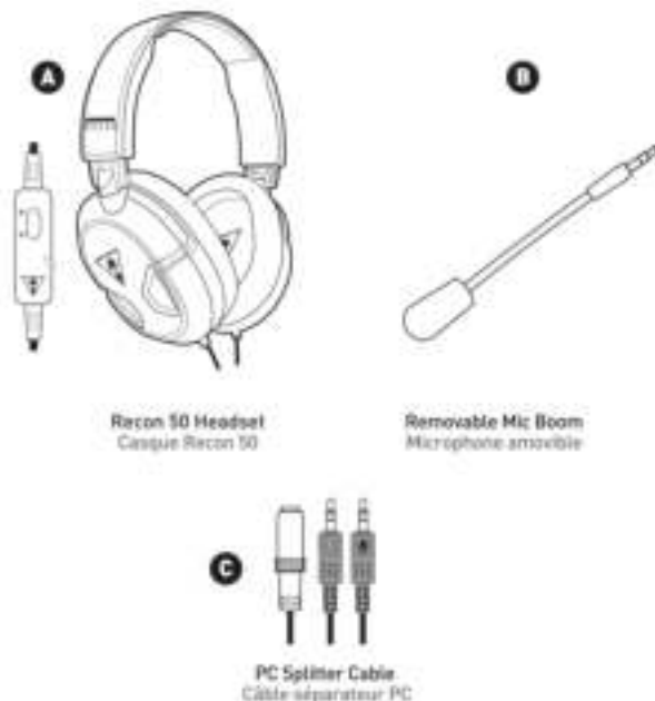
Recon 50 Headset Casque Recon 50