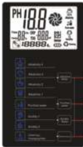
Alkaline Water Level Button