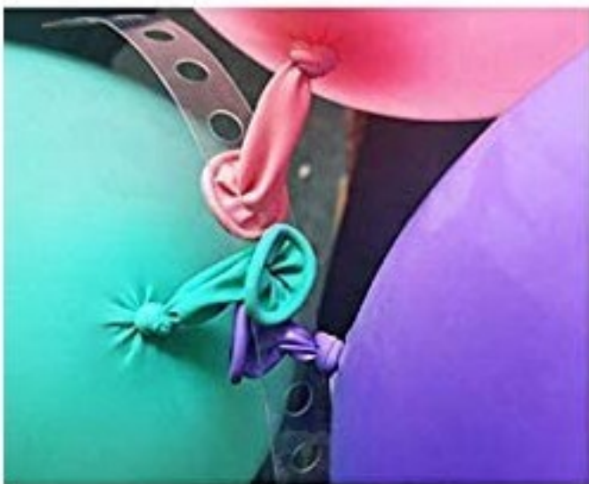
3. Balloons of different sizes can be inserted on both sides