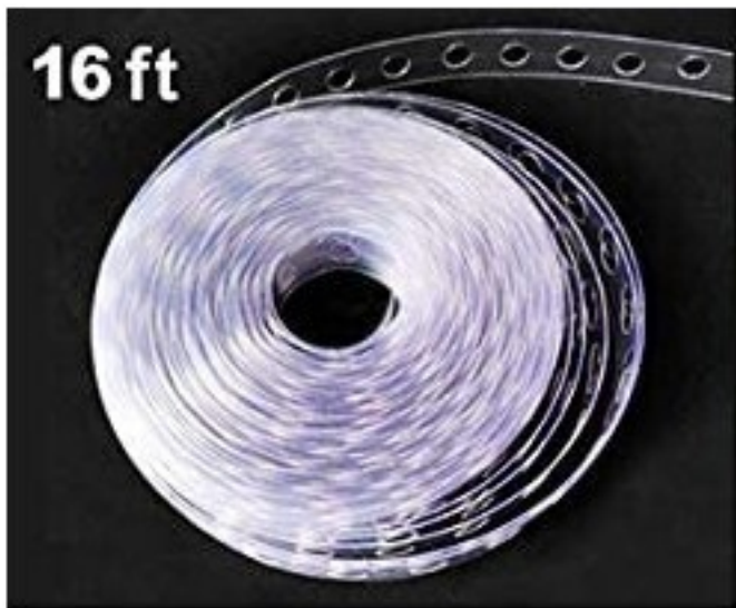
1. Ready the balloon decorating strip