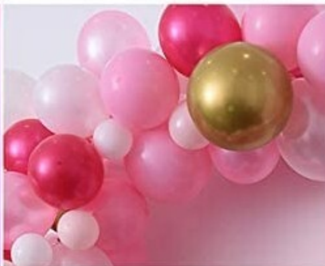
4. Hang the balloon arch or garland on the wall and fix it with ribbon