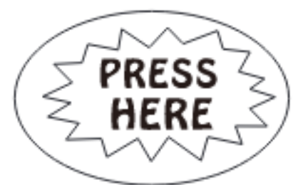
Press the mark on animal hand, then it will make noise.

ADULT SUPERVISION IS RECOMMENDED REMOVE ALL PLASTIC FASTENERS AND HANG TAGS BEFORE GIVING TOY TO CHILD. THESE ATTACHMENTS ARE NOT PART OF THE TOY. COLORS AND CONTENTS MAY VARY RATIONS