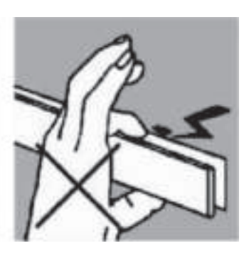
Due to the strong magnetic force, be careful of your fingers and hands when covering the backing.