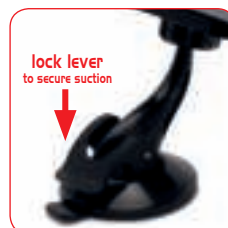
Suction cup bracket, very secure mounting