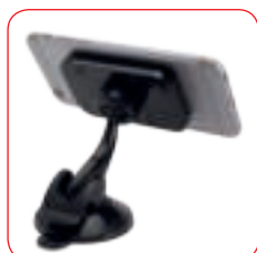
Easy suction cup system

Smartphone holder with suction cup fixation