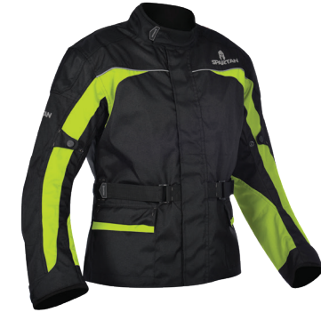
BLACK / FLUO J17F