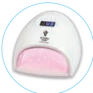
Cure in a lamp: LED approx. 10-20 sec., UV approx. 60-90 sec. Depending on the thickness of the applied layer.