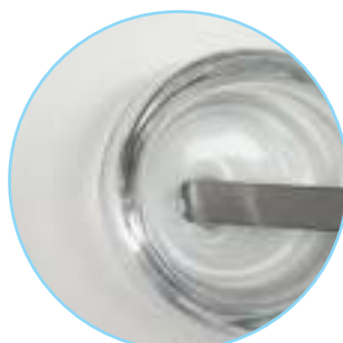
Dip the spatula in MASTER GEL LIQUID.