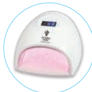
Cure in an LED lamp for 30 sec., UV for 120 sec.