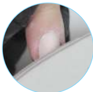
Buff using a nail buffer.