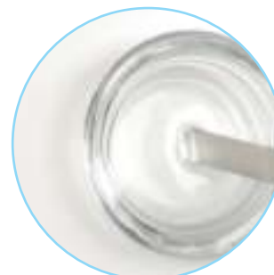
Dip the spatula in the liquid, apply a second layer.