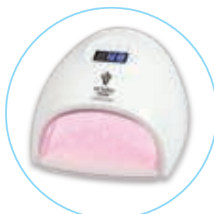
Cure in a lamp: LED 10 sec, UV 60 sec.