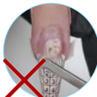
WRONG APPLICATION Do not let air enter. Do not stretch or twist the mass.