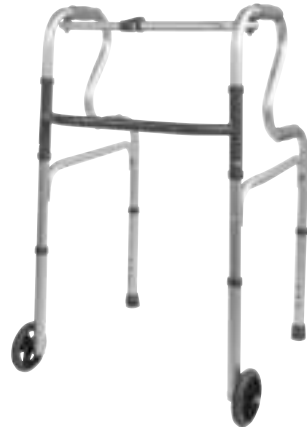
VP179B Dual Riser Folding Walking Frame (Wheeled)

This file is available to view and download as a PDF at www.aidapt.co.uk . Sight impaired customers can use a free PDF Reader (such as adobe.com/reader ) to zoom in and increase the text size for improved readability.