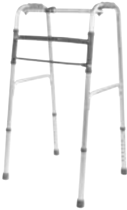
VP129F Folding Walking Frame (Unwheeled)