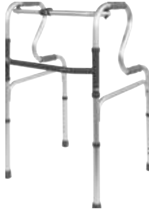
VP179A Dual Riser Folding Walking Frame (Unwheeled)