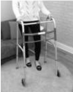
VP129FW Folding Walking Frame (Wheeled)