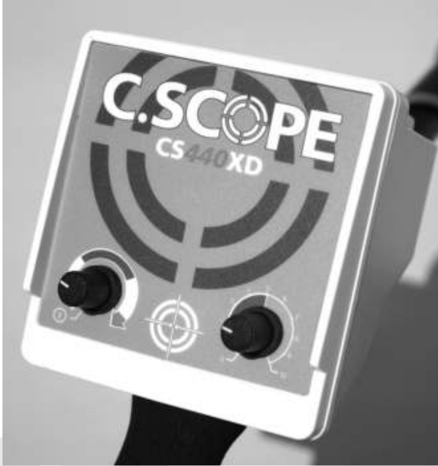
C.Scope CS440XD Metal Detector