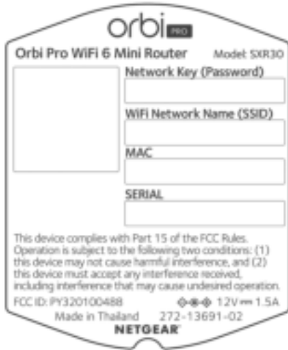
Figure 3. Orbi Pro WiFi 6 Mini router label

The Orbi Pro WiFi 6 Mini router label shows the login information, the WiFi network name and password, the router's MAC address, and the router's serial number. The following is an example of what the router label might look like: