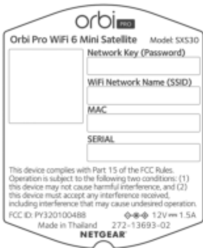
Figure 4. Orbi Pro WiFi 6 Mini satellite label

The Orbi Pro WiFi 6 Mini satellite label shows the WiFi network name and password, the satellite's MAC address, and the satellite's serial number. The following is an example of what the satellite label might look like: