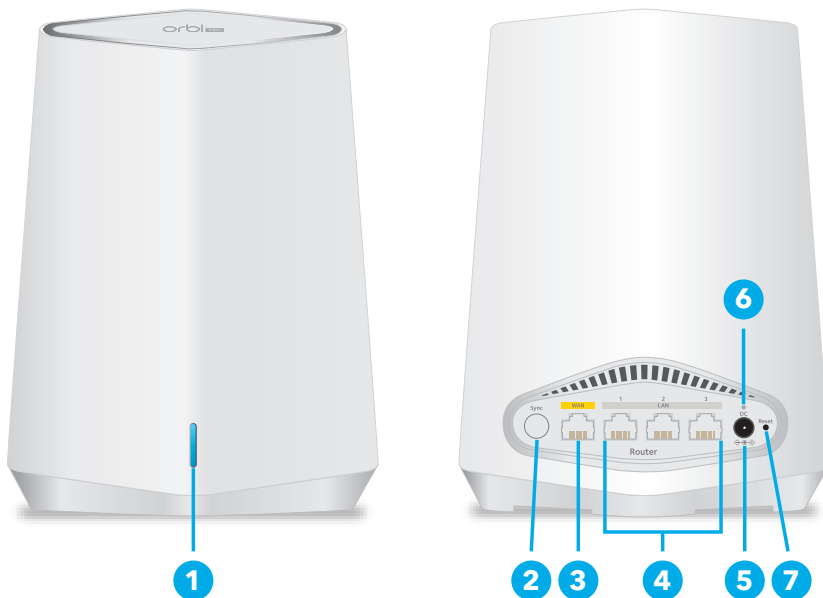
Figure 1. Orbi Pro WiFi 6 Mini router model SXR30, front and back views