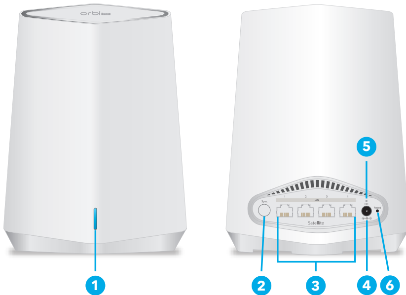
Figure 2. Orbi Pro WiFi 6 Mini satellite model SXS30, front and back views