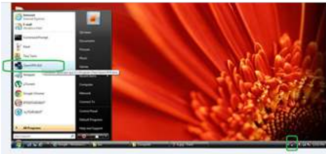
Figure 5. The OpenVPN icon displays in the Windows taskbar.

TIP: You can create a shortcut to the VPN program, then use the shortcut to access the settings and select the run as administrator check box. Then every time you use this shortcut, OpenVPN automatically runs with administrator privileges.