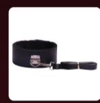
COLLAR WITH LEASH