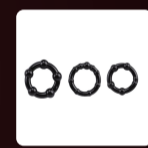
COCKRING SET OF 3