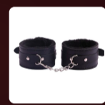
ANKLE STRAP SET