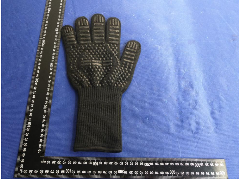
Photo 2 Appearance of EUT