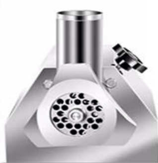
5. Lock the screw nut