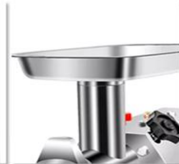
6. Install the tray