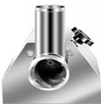
1. Assemble the housing into the main body