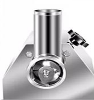
2. Insert the helix into the housing