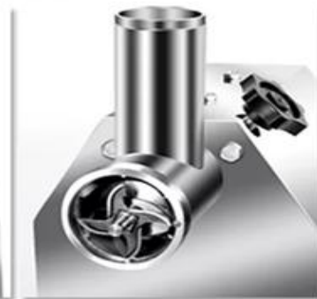
3. Put the cross blade into the helix