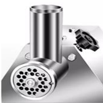
4. Install the well plate