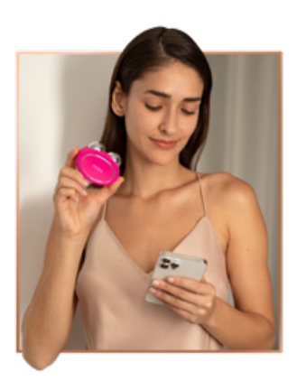
3. TONE & LIFT

Note: BEAR™ 2's default setting is 'Beginner Mode' (microcurrent intensity levels 1 - 5). If you wish to access 'Pro Mode' (microcurrent intensity levels 6 - 10), you can do so via 'Settings' in the app. Once you select 'Pro Mode', the intensity indicator lights on your device will refer to the Pro Mode levels (6 - 10).