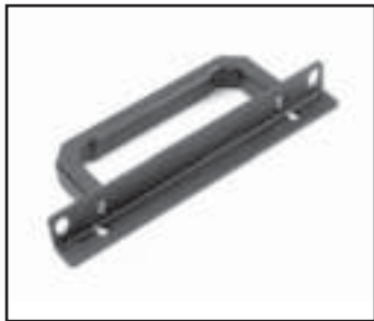
M4 screw x 4, one left support handle and one right support handle