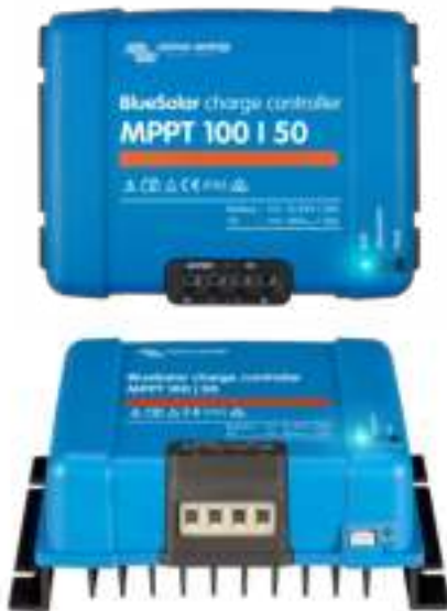
BlueSolar Charge Controller MPPT 100/50