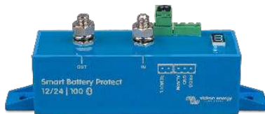
Smart BatteryProtect BP-100