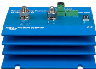
Smart BatteryProtect BP-220