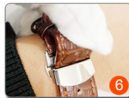
6. Put the other side strap into the buckle