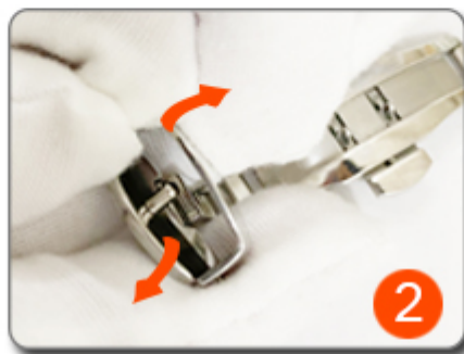
2. Found the top of the clasp cover