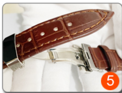
5. Press and hold the buckle on the short side strap