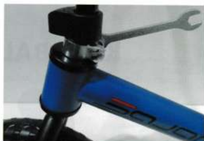
2. Tight the clamp.