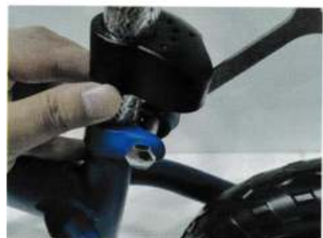
3. Tight the clamp.