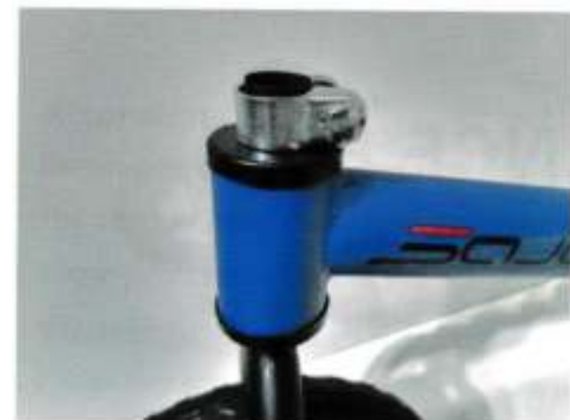
1. Place the steering wheel on the fork.