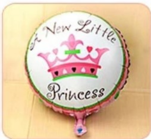
③ Finish to inflate