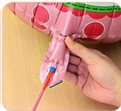
② insert straw from inlet port , let air leak