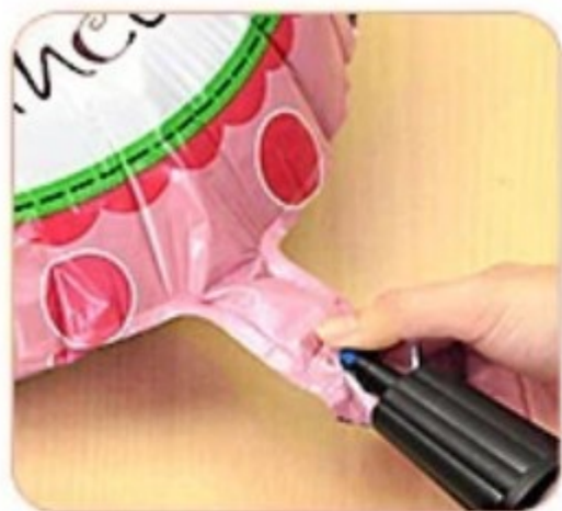
① find the inlet port