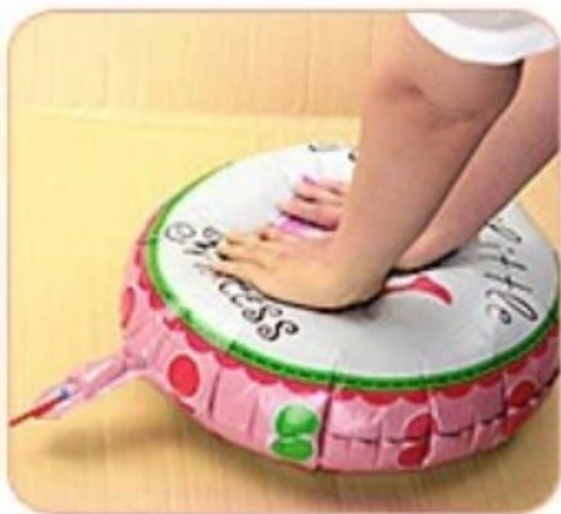
③ press lightly until without air