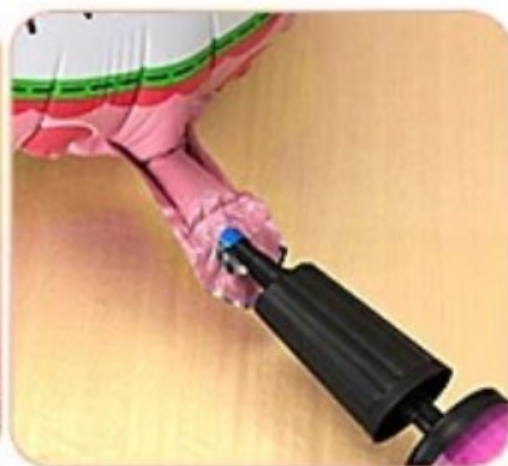
② inflate with PUMP