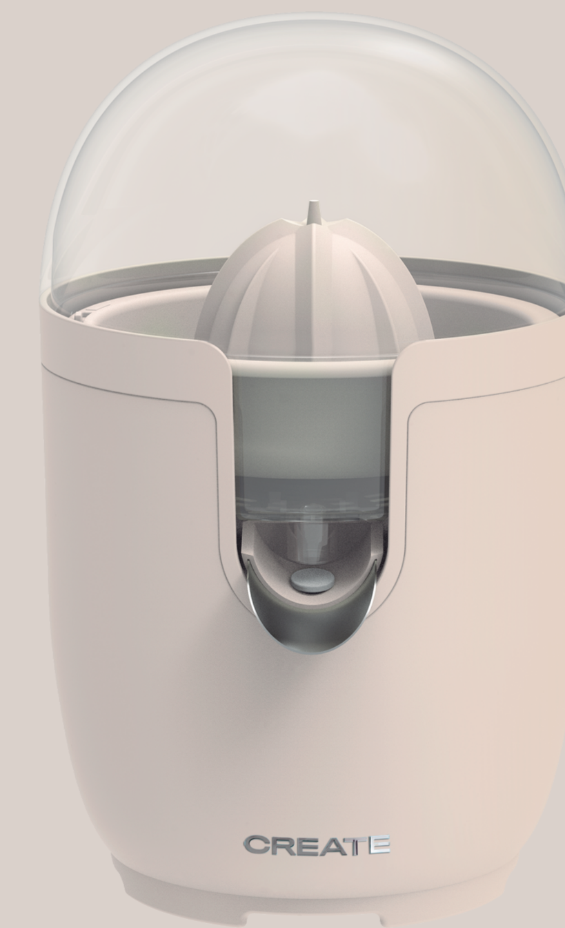
Juicer Retro Electric citrus juicer | Exprimidor eléctrico de cítricos