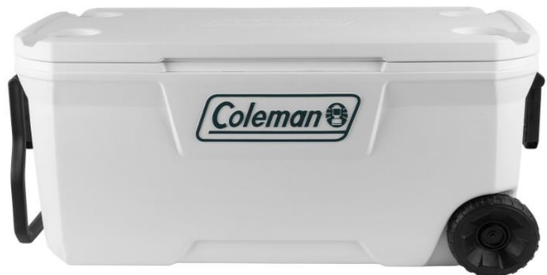
100 QT XTREME MARINE