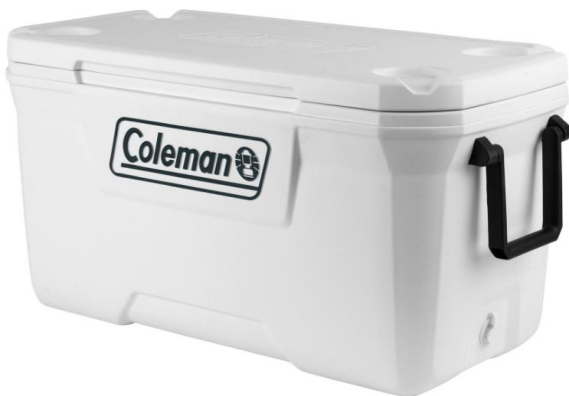
70 QT CHEST XTREME