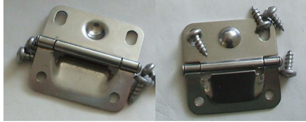
78073ZCL (70 - 100 QT)