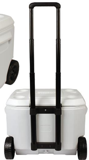
50 QT MARINE