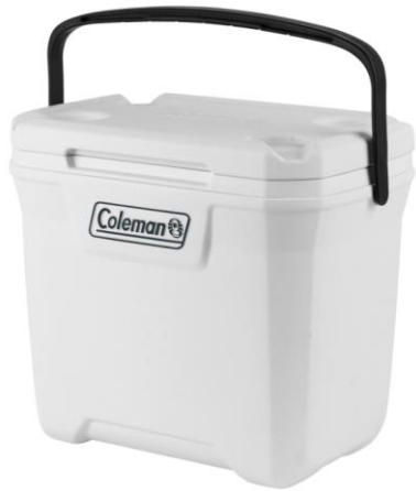
28 QT XTREME MARINE