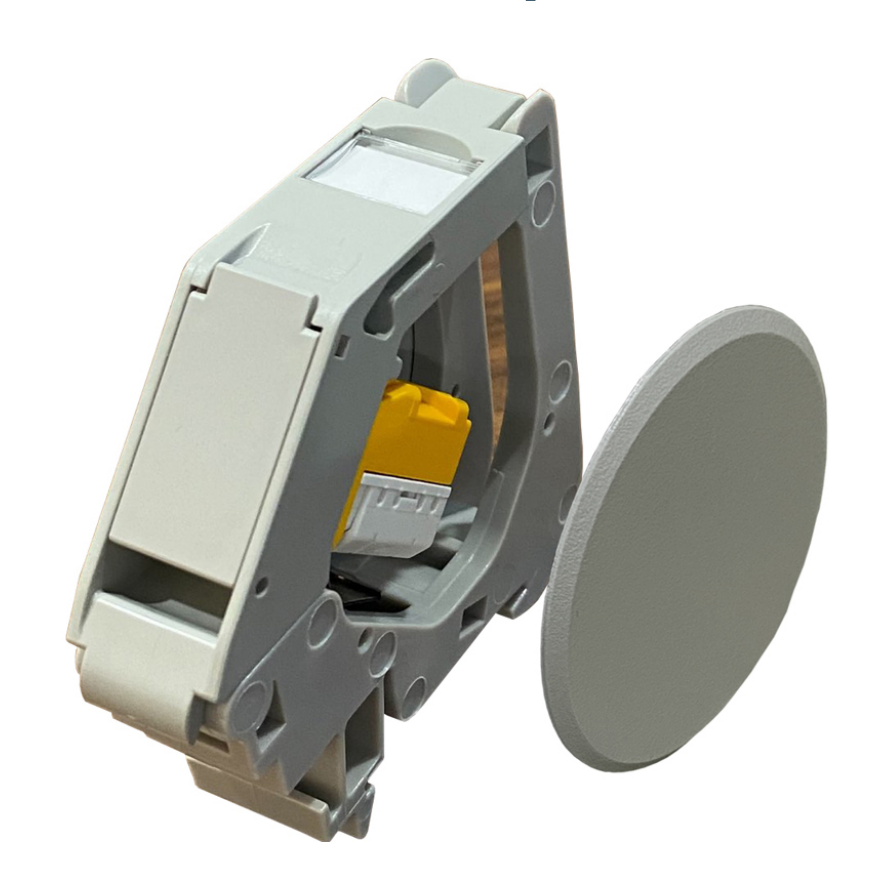
* NOTE: RJ45 Jacks sold separately