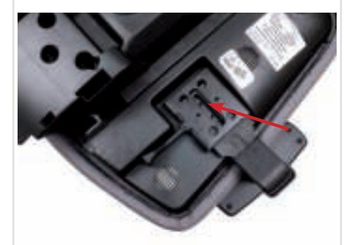
For the armrests you need the Allen key and 1 screw per side. The screw must go in the inner hole.