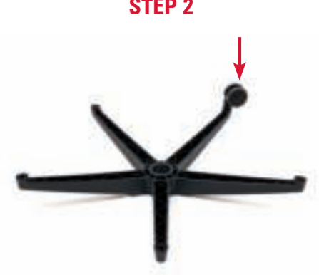
Place the base (1) upside down and press the five castors (2) into the five holes. Watch out for damage to the floor or table! For example, put a towel underneath.