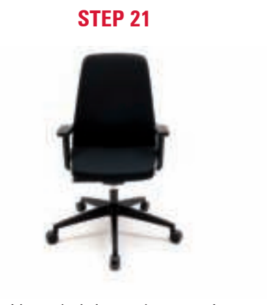
Your chair is ready to use! ENJOY!

For questions regarding installation, please call +31 (0) 71 581 24 30 (Mon-Fri, from 8 a.m. to 5 p.m.)