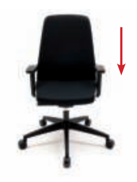
Push the seat firmly. This can also be done by sitting down on the chair.