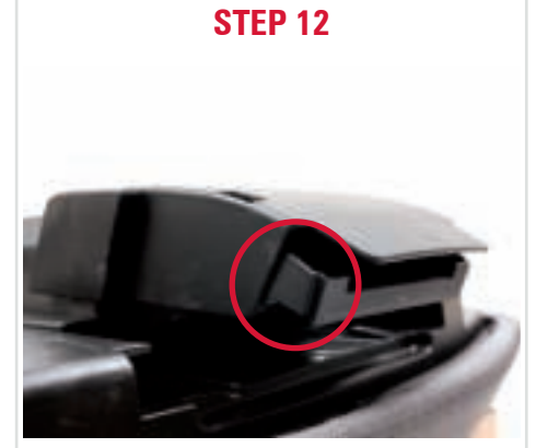
Push the cover in and then down until the cover falls completely over the marked parts.