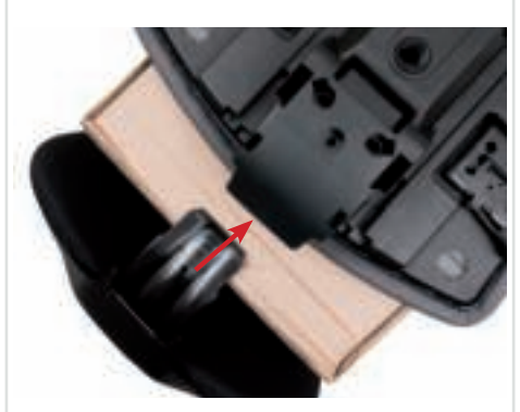
Make sure the cover is properly in place. Now slide the backrest into the opening for the back bar.