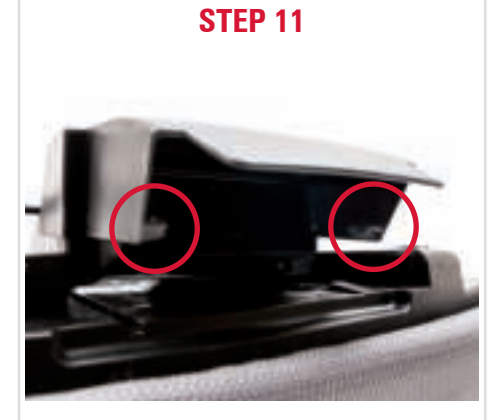
It is important that the cutouts in the cover fit over the marked parts.