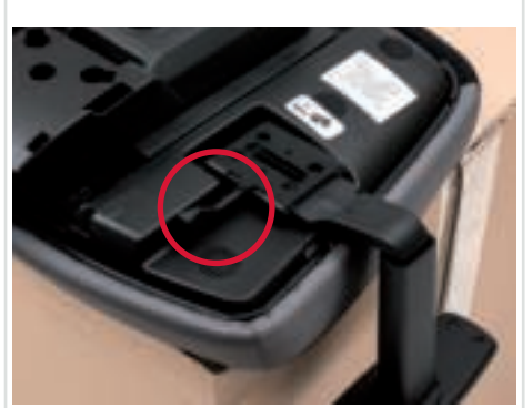
Slide the armrest (6) into the opening. Make sure that the lever is open (push in as marked).