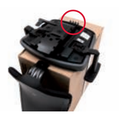
Before assembling the backrest (9), prepare the mounting set with the Allen key and the screws (8).