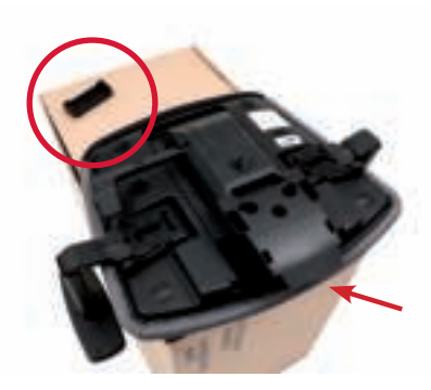
Now take the black plastic cover (7). During transport, this could also be loose in the box.