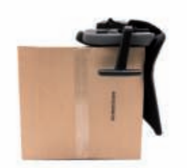
To assemble, you have to slide the backrest between the large and the small cover.