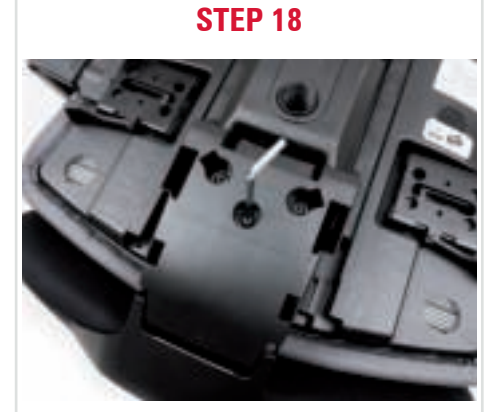
Tighten the screws only lightly at first before tightening them all with the Allen key.