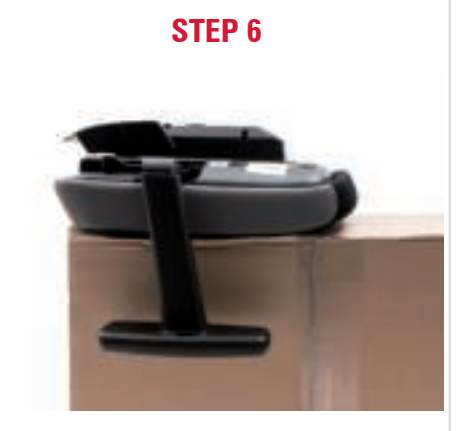
Also pay attention to the difference between left and right, the armrest must point forward. The front of the seat is black.