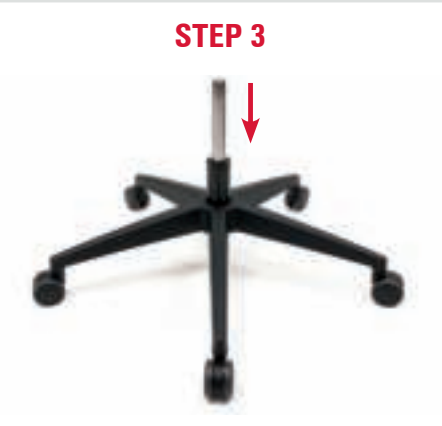
Place the base on the wheels and insert the gas spring (3).