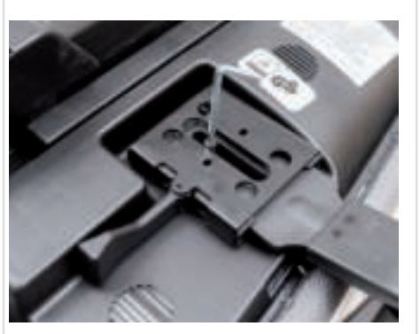
First, loosely tighten the screw with the Allen key. Then fully tighten. You will need to use some force to insert the screw. Then close the lever.