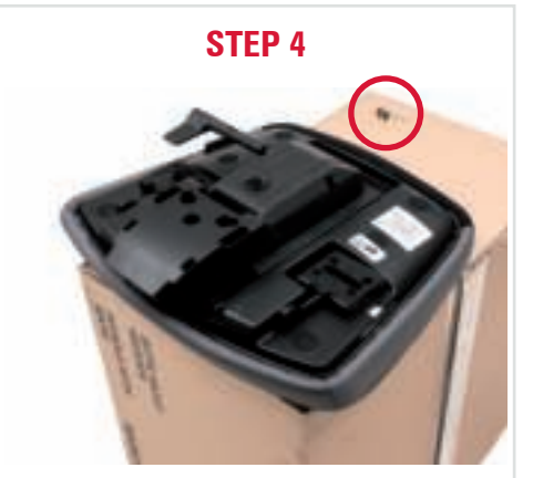
Turn the seat (4) upside down. You can use the box as a handy assembling stool. Take the mounting kit with the Allen key and the 2 screws (5).