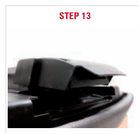
In this way, the cover fits well.