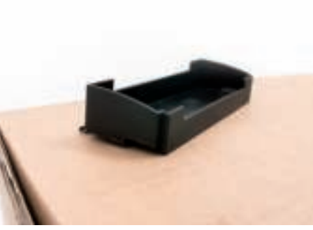
This cover must be placed under the back cover before the backrest can be assembled.