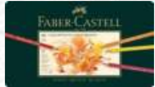
110060 (60 colours)