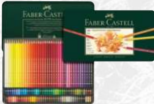
110011 (120 colours)