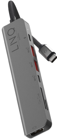
7 in 1 Pro Multiport Hub Model #: LQ48016