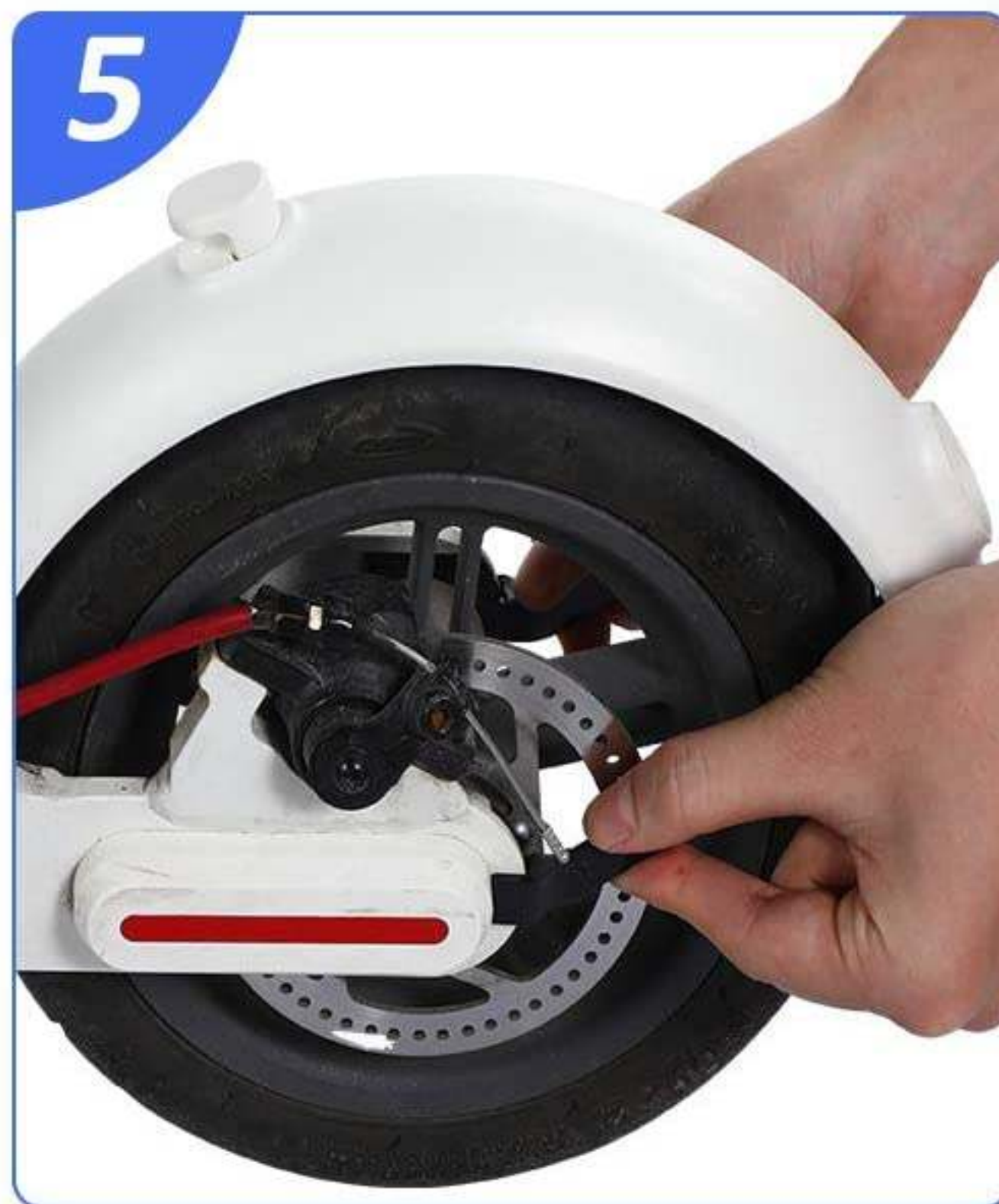
5 Insert the sides of the bracket into the groove