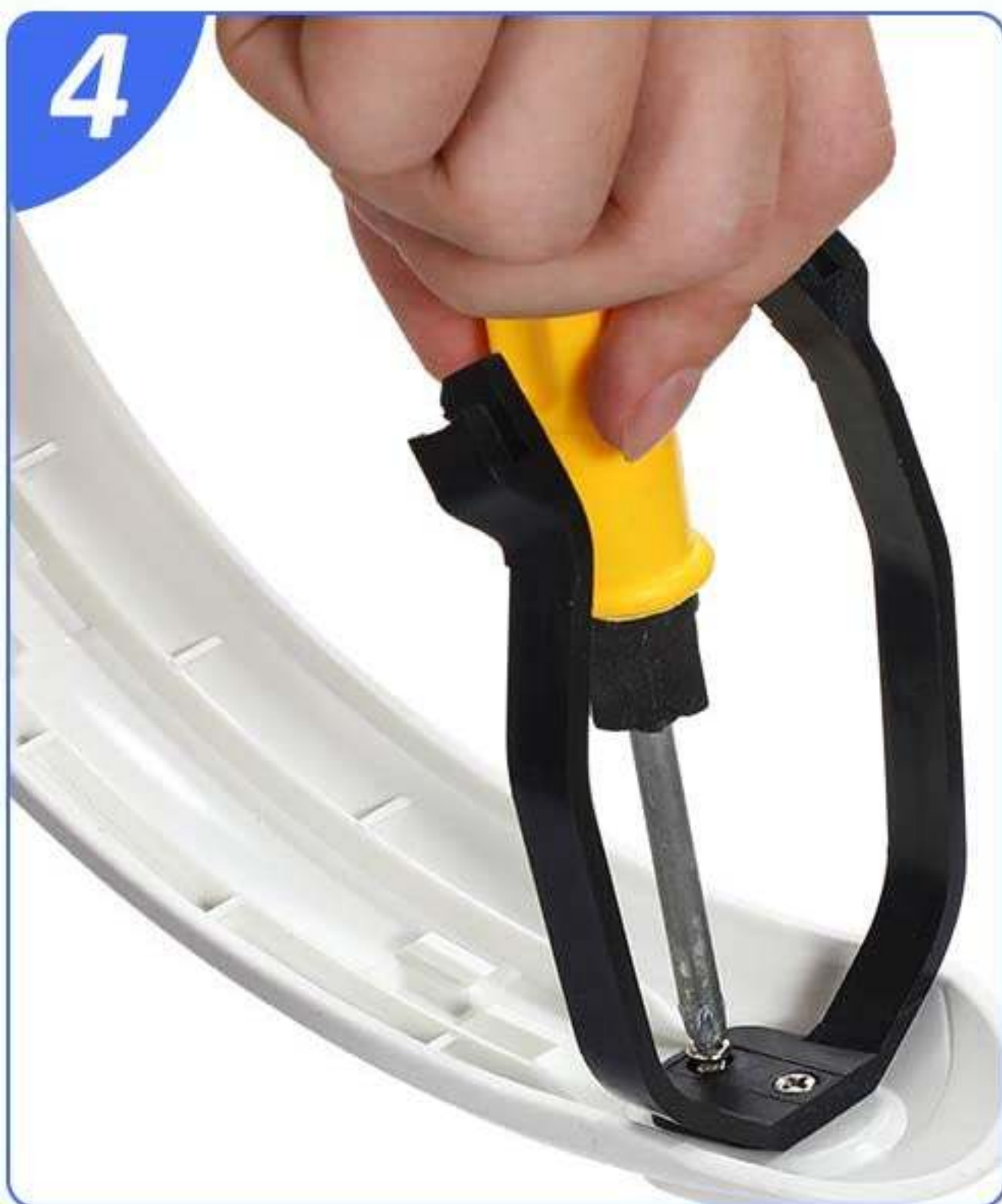
4 Install the fender bracket with two screws that are delivered and tighten