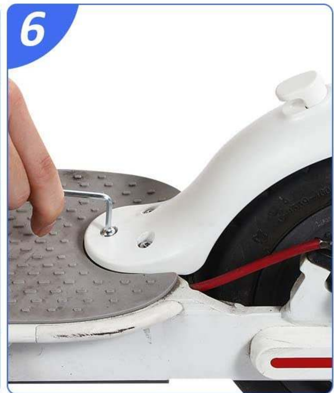
6 Tighten the screws clockwise with an Allen wrench