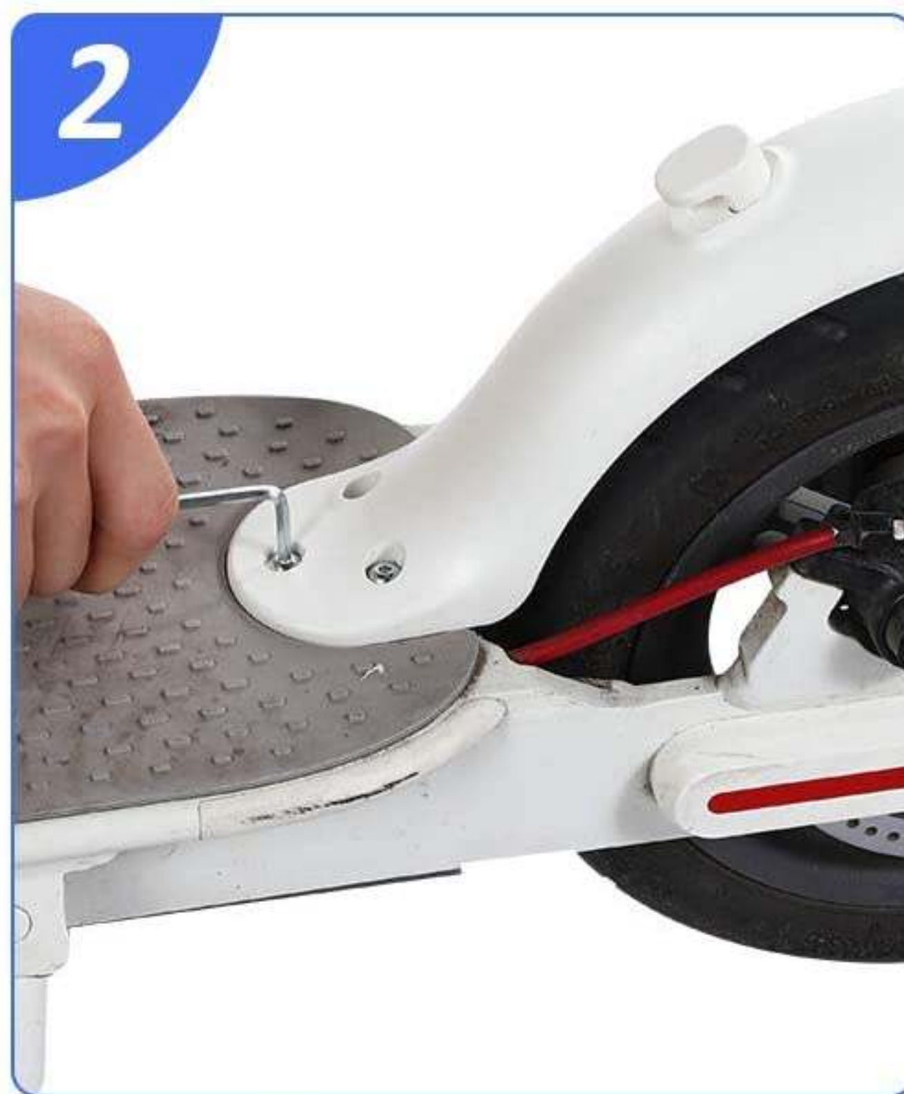
2 Unscrew the screw counterclockwise with an Allen wrench