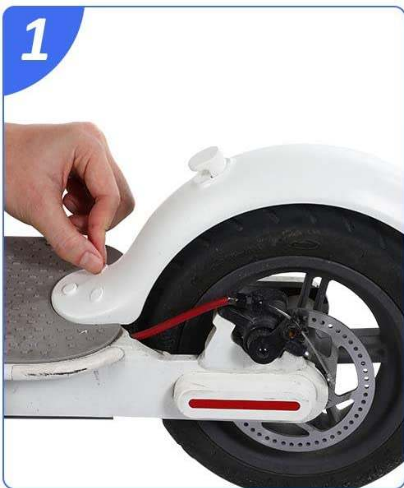
1 Remove the silicone cap