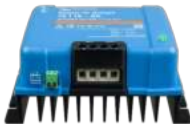
Orion-Tr Smart 12/12-30