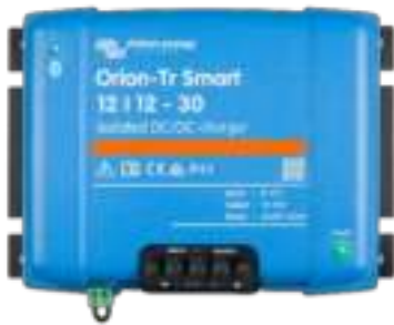
Orion-Tr Smart 12/12-30