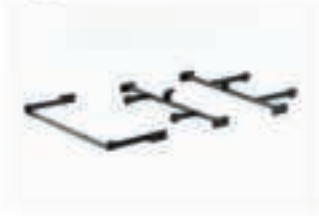
STF-23-4K METAL FRAME Page.59