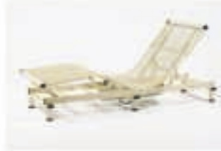
STF-10-4K GOLD WAVE Page.24-29