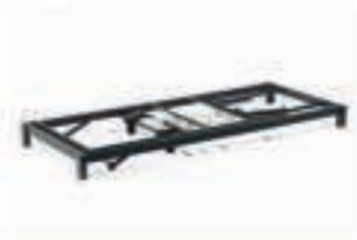
STF-88 CREATION FIX Page.50