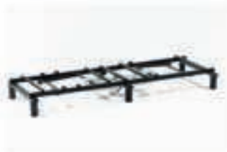
STF-24-4K METAL FRAME Page.52