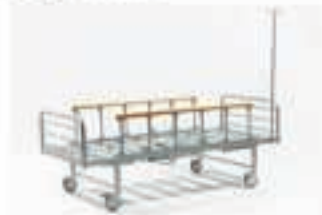
STF-18-4K CARE BED Page.44-47