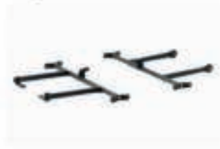
STF-22-4K METAL FRAME Page.60