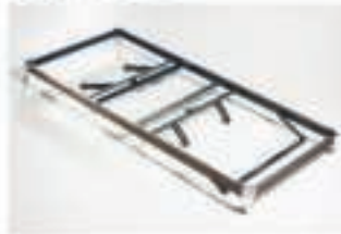
STF-15-4k RELAXMOTION Page.48-49