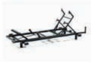
STF-27-5K PULLBACK FRAME Page.55