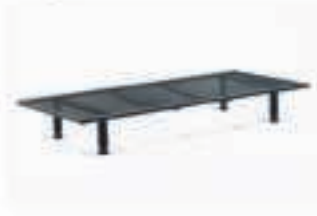
STF-45 AIRBOXX INSIDE FIX FRAME MESH Page.66