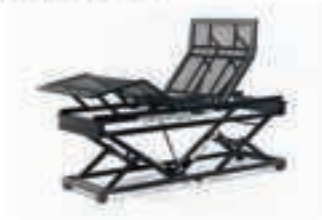
PERFECT MOTION Page.32-37