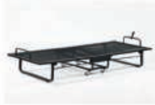
STF-195 FOLDABLE AIRBOXX MESH BED Page.64