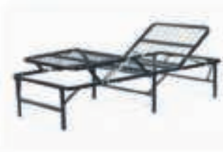
STF-130-4K MANUAL ADJUSTABLE BED Page.63