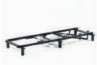
STF-25-5K METAL FRAME Page.57