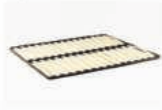
STF-141 SLETTED BED Page.66