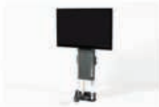
ST-74 TV LIFT Page.74