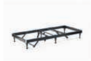
STF-67-4K S-LINE METAL FRAME Page.56