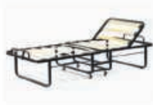
STF-119-4K FOLDABLE SLETTED BED Page.63