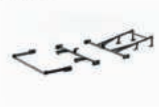
STF-23-5K METAL FRAME Page.59