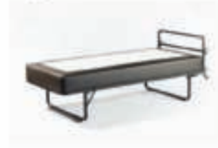
STF-144 FOLDABLE HOTEL BED Page.67