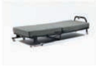
STF-110 FOLDABLE SPRING BED Page.65