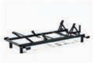
STF-27-4K PULLBACK FRAME Page.54