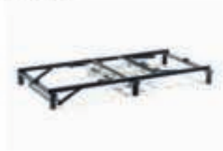
STF-28 METAL FRAME Page.58