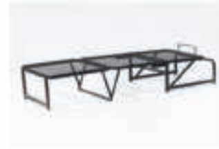
STF-140 FOLDABLE METAL BED Page.65