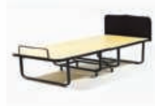
STF-199 FOLDABLE WOODEN BED Page.64