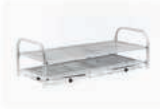
STF-190 TWIN BED Page.68