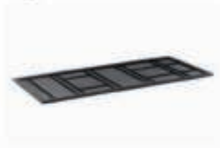
STF-42-5K AIRBOXX FRAME Page.61