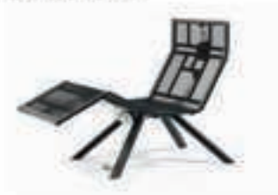
STF-90-5K DOUBLE REST Page.40-43