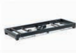
STF-70 HIGH-LOW PERFECT MOTION Page.51