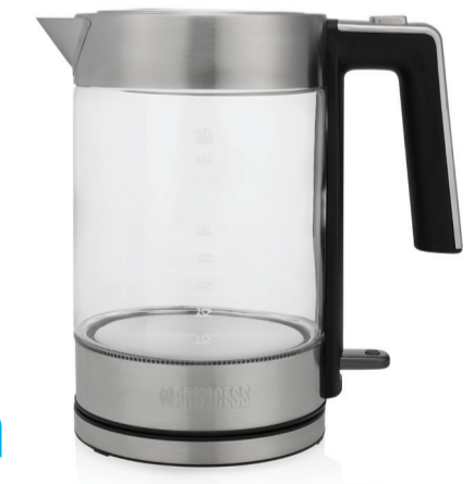
Glass Kettle London