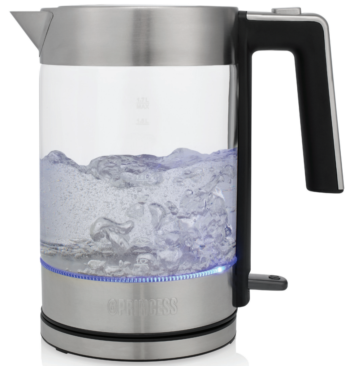
Glass Kettle London

NL Glazen waterkoker London | FR Bouilloire Londres | DE Glas-Wasserkocher London | ES Hervidor de Agua Londres PT Jarro Fervedor London | IT Bollitore vetro London | SV Vattenkokare av glas - London | RU Стеклянный чайник London | PL Szkłany czajnik London