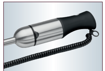
Extra-long coiled cable (space-saving)