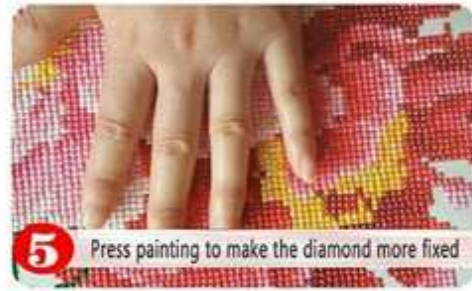
5 Press painting to make the diamond more fixed