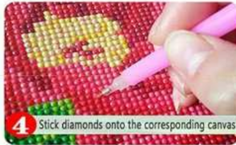
4 Stick diamonds onto the corresponding canvas