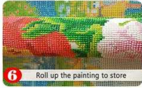
6 Roll up the painting to store