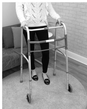
VP129FW Folding Walking Frame (Wheeled)