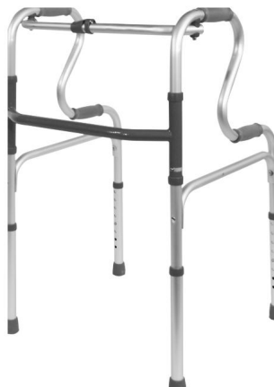
VP179A Dual Riser Folding Walking Frame (Unwheeled)