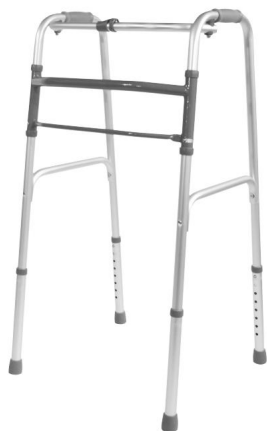
VP129F Folding Walking Frame (Unwheeled)