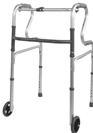
VP179B Dual Riser Folding Walking Frame (Wheeled)

This file is available to view and download as a PDF at www.aidapt.co.uk . Sight impaired customers can use a free PDF Reader (such as adobe.com/ reader) to zoom in and increase the text size for improved readability.