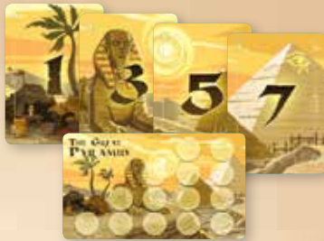
The Great Pyramid