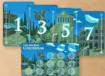
The Ancient Colosseum