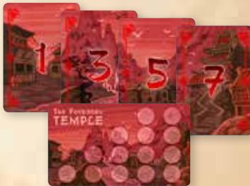
The Forbidden Temple