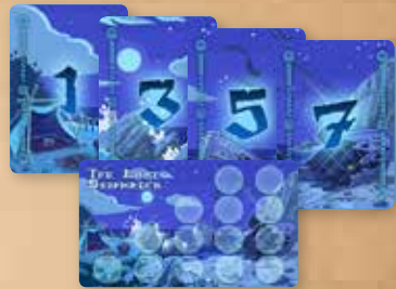
The Lost Shipwreck